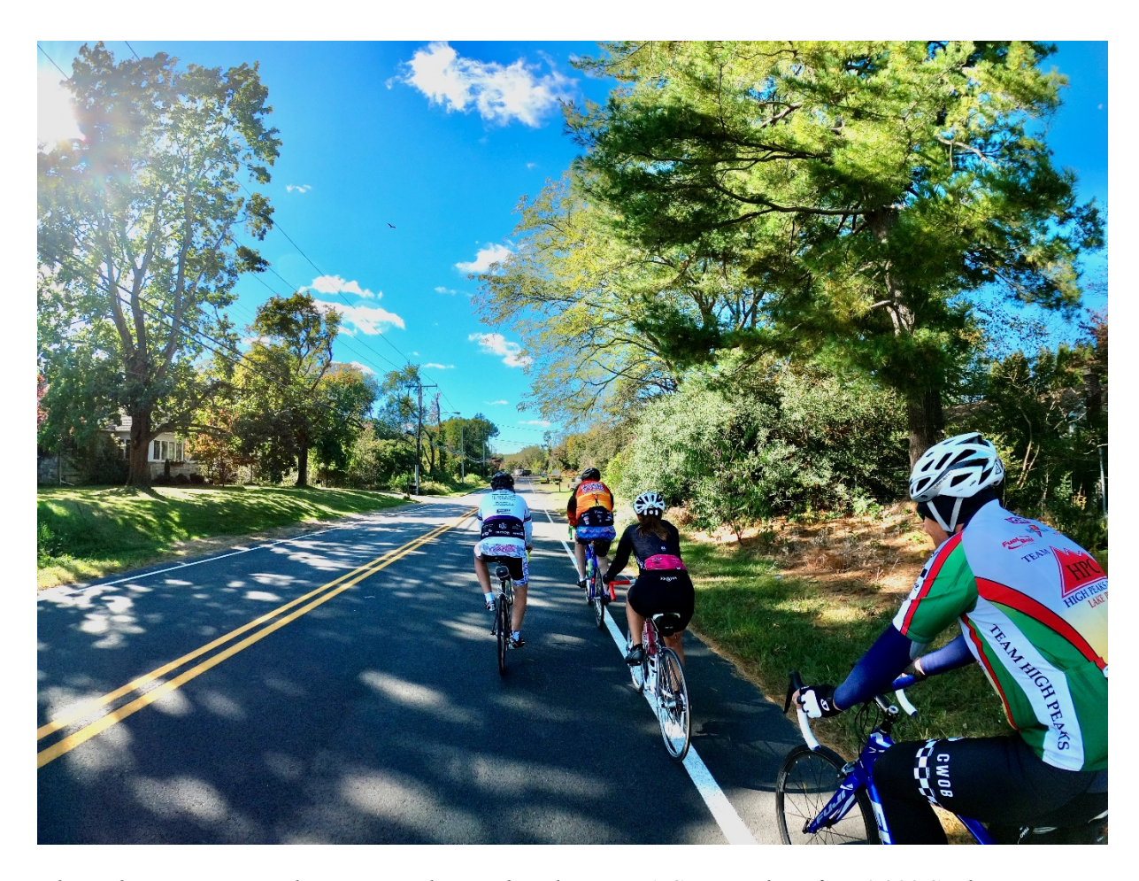
The Kids-N-Hope Foundation teamed up with Riders For A Cause to host first 1,200 Spokes For Hope Tour, encouraging participants to ride and raise funds to support both organizations' missions.