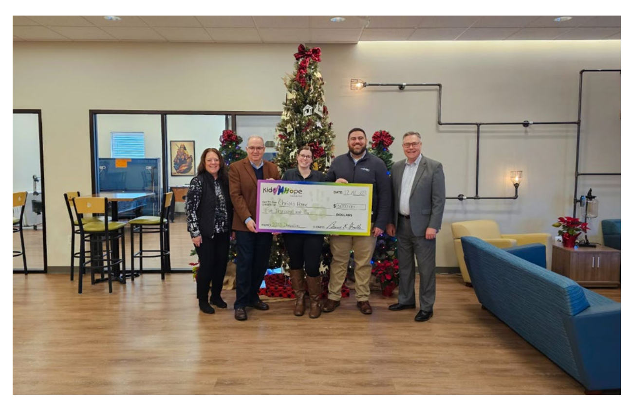
The Kids-N-Hope Foundation presents Christ's Home Children and Family Services with a check for $5,000.