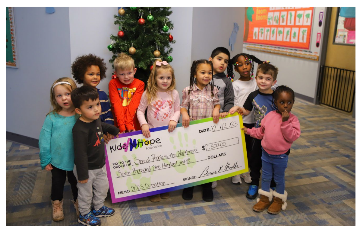
The Kids-N-Hope Foundation presents Special People in the Northeast (SPIN) with a check for $7,500.