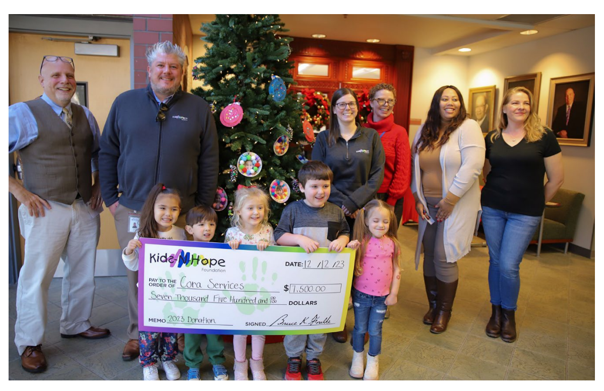
The Kids-N-Hope Foundation presents CORA Services with a check for $7,500.